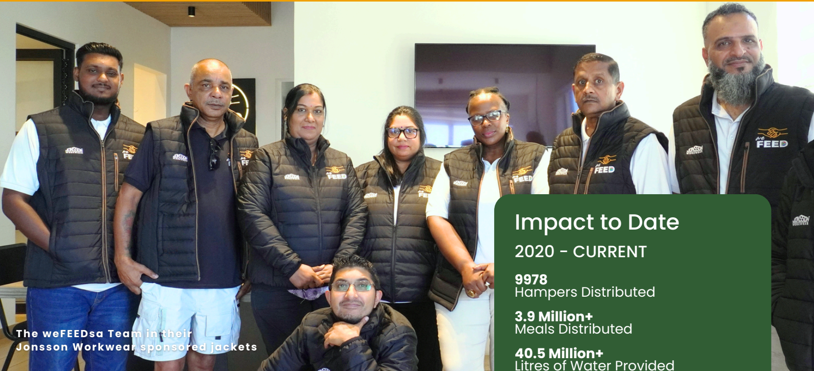
The weFEEDsa Team in their Jonsson Workwear sponsored jackets