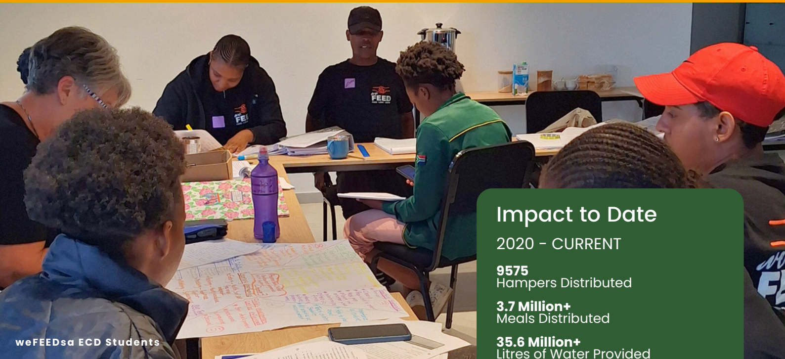
weFEEDsa ECD Students