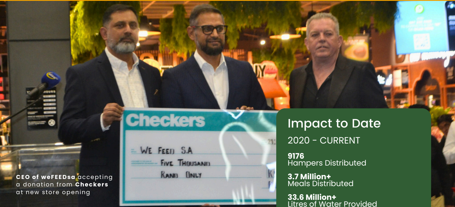
CEO of weFEEDsa accepting a donation from Checkers at new store opening