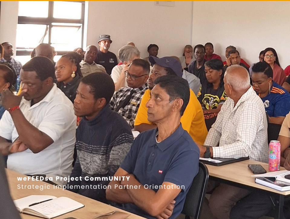
weFEEDsa Project COMMUNITY Strategic Implementation Partner Orientation